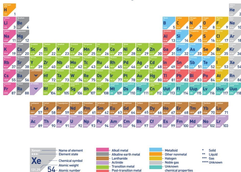
Periodic Table of Elements

You could also add up the atomic masses of all of the atoms in a molecule to determine the molecular mass of that molecule. Using the periodic table, add up the molecular mass of H 2 O.